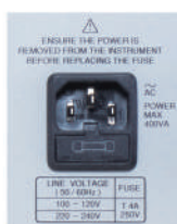
Universal Input Voltage Range

Additionally, the GPT-9600 series provides the universal input voltage range for operating equipment in countries with different electrical power standards. With the GPT-9600 series, the hustle of switching or selecting input voltage range can be left behind. Furthermore, 50Hz or 60Hz can be selected to provide a stable and appropriate test voltage without relying on the electrical environment conditions of input power so as to meet the test requirements.