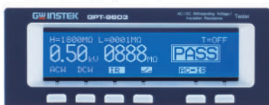
Large LCD, High Intensity Indicators and Function Keys

The 240 x 48 display clearly shows the applied voltage, test parameters, test conditions, measurement value and result on the screen at the same time. The real-time status update on the LCD display accompanied by the multi-colored LED status indicators on the front panel allow operators to have a full control of the test process to perform precision test and avoid unnecessary operation risks at the same time. The status indicator above the high voltage output terminal will automatically flash when an output is in place. In addition, the function keys arranged below the LCD display provide convenient operation that test functions can be easily changed by a single pressing.